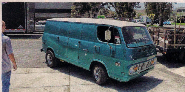
Our eBay van as initially delivered. It had a strong small-block and a line-lock for burnouts; all it needed was some nitrous and a ton of patch panels purchased off of eBay.