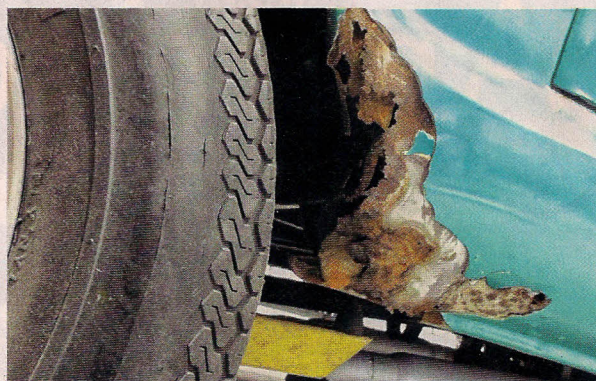
Our initial, positive impressions were immediately dashed once we started picking around the rockers and fender bottoms. We expected some rust, as the van came from Ohio, but we were surprised by the patch panels used to patch previous patch panels (say that three times, fast). The floors were surprisingly solid, but even the A-pillars had seen the rust worm.